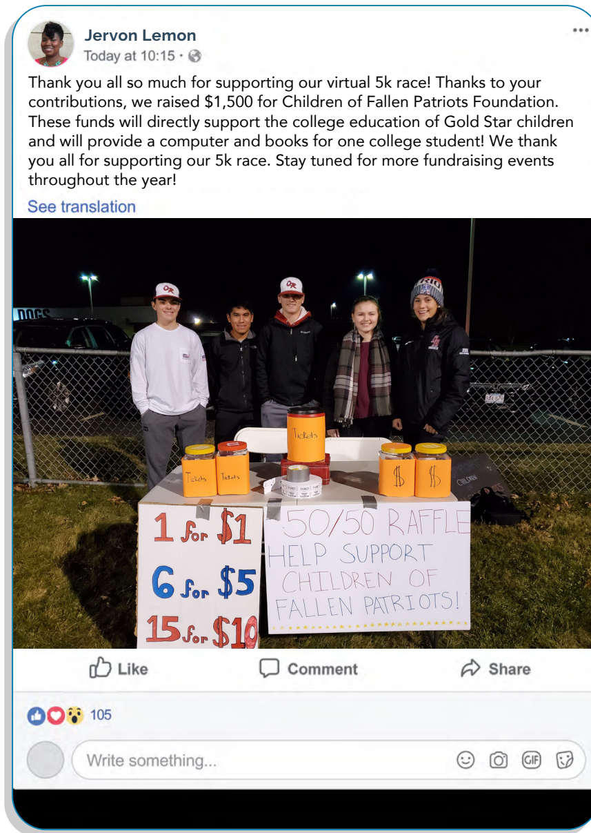
Sample Facebook Post

You can never thank people enough for their generosity and support. It's better to thank people soon after they donate, so make sure you're set up to receive alerts when someone has donated to your fundraiser. The donor will receive an automated thank you with receipt, but it's always nicer to add that personal touch by reaching out to thank them directly. Personal phone calls and emails as well as social media posts show people both privately and publicly how much you appreciate their support and may serve to motivate others to support your fundraiser, too.