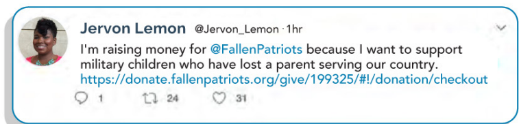
Sample Twitter Post