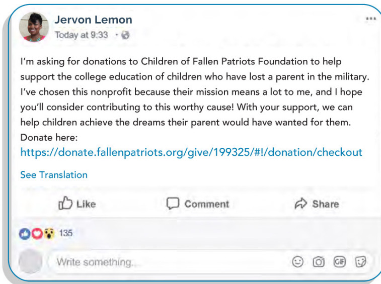
Sample Facebook Post

Finding the right words to make your ask can be hard. Take a look at some of our sample messages below for inspiration!